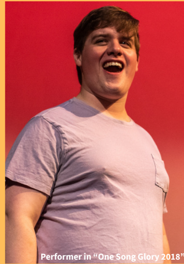
Performer in "One Song Glory 2018"