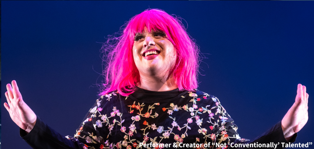
Performer & Creator of "Not 'Conventionally' Talented"