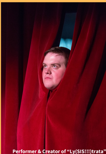
Performer & Creator of "Ly(SIS!!!)trata"