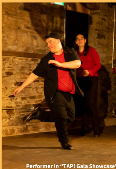
Performer in "TAP! Gala Showcase"