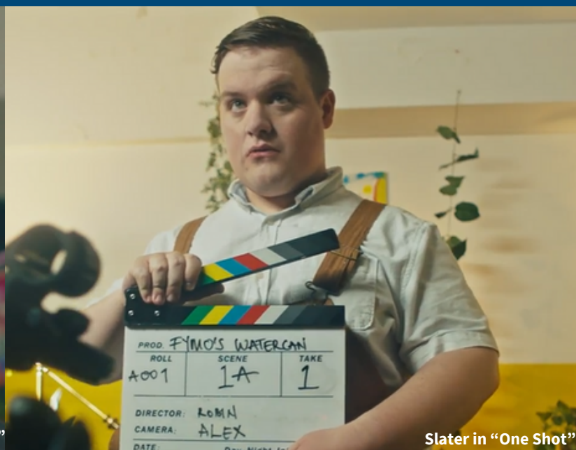
Slater in "One Shot"