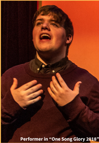
Performer in "One Song Glory 2018"