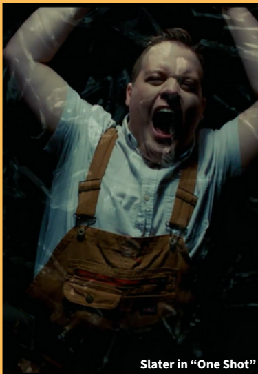
Slater in "One Shot"