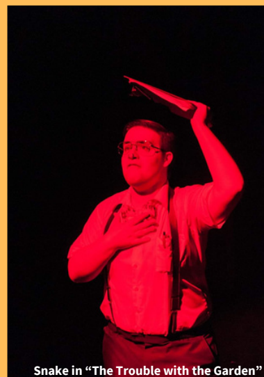
Snake in "The Trouble with the Garden"