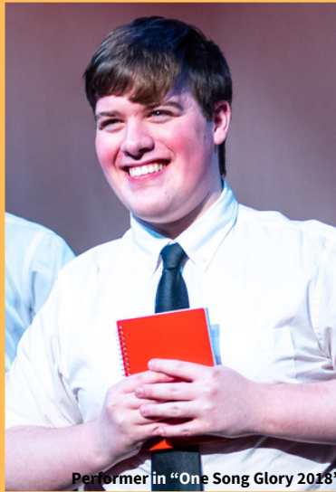
Performer in "One Song Glory 2018"