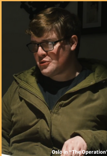
Oslo in "The Operation"